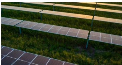
Invenergy's 100 th project, Southern Oak Solar Energy Center, located in Mitchell County, Georgia.

Commits to developing projects while minimizing impacts to sensitive ecological resources and ensuring responsible land use